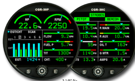
CGR-30 Combo Pkg Primary Replacement (STC'd/TSO'd) 4-CYL/6-CYL $1,000 Rebate!