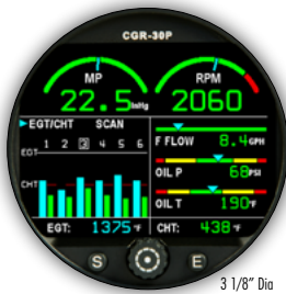
CGR-30P Premium Pkg Primary Replacement (STC'd/TSO'd) 4-CYL/6-CYL $500 Rebate!