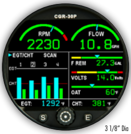
CGR-30P Basic Pkg Primary Replacement (STC'd/TSO'd) 4-CYL/6-CYL $750 Rebate!

Rebate Valid: October 8 - November 5, 2018 REBATE AMOUNTS SHOWN BELOW