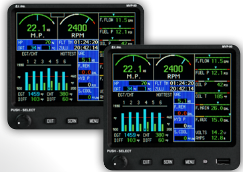
5.52" x 5.16" MVP-50P Twin Pkg Primary Replacement (STC'd/TSO'd) 4-CYL/6-CYL $2,000 Rebate!