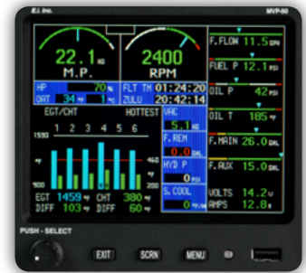
5.52" x 5.16" MVP-50P Primary Replacement (STC'd/TSO'd) 4-CYL/6-CYL $1,000 Rebate!