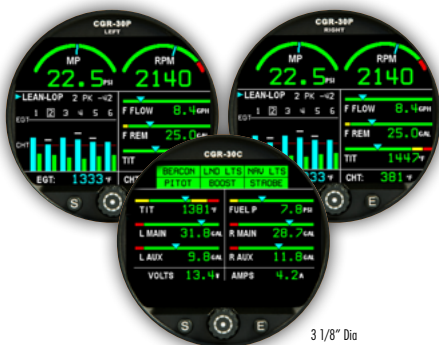
CGR-30P Twin Pkg (P+P+C) Primary Replacement (STC'd/TSO'd) 4-CYL/6-CYL $1,500 Rebate!